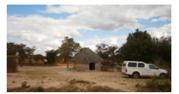
The earth is the LORD's, and everything in it. The world and all its people belong to him" (Psalm 24:1)