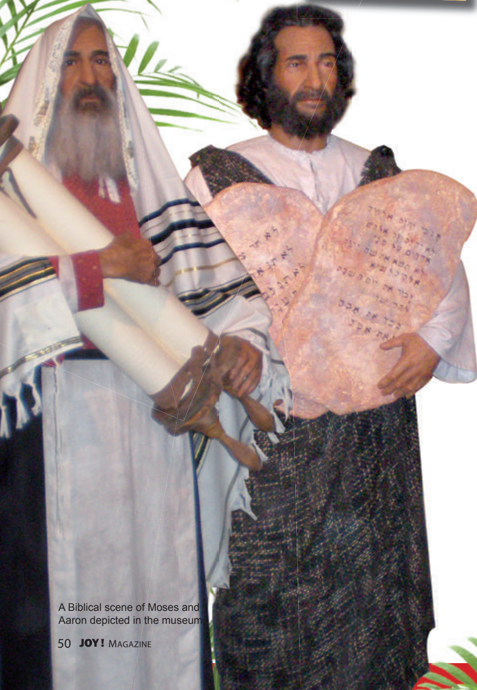
A Biblical scene of Moses and Aaron depicted in the museum

magnificent gardens celebrating God's Creation. Over 6 000 plants surround the three acre lake, with 500 varieties of flora filling the gardens.