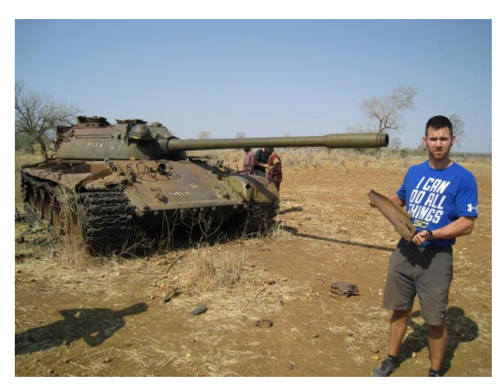
"His Word is in my heart like a fire, a fire shut up in my bones. I am weary of holding it in; indeed, I cannot." Jeremiah 20:9

This Sudanese tank on the above right made it to within 500 yards of the village before the SPLA - N (soldiers protecting the Christians) destroyed it. On the above left is a picture about 6 miles from the village of the community that was displaced from the attacks. We had the privilege of ministering to and sharing with them.