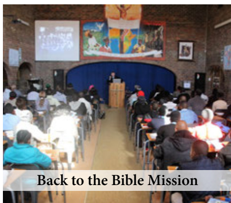
Back to the Bible Mission