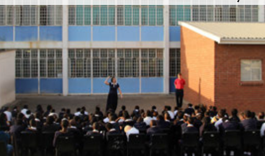
Advance For Life Christian Academy

At one of our mid-week services, a group of home schoolers had driven quite some distance in order to hear us. They were grateful for the home schooling textbook resources we are providing.