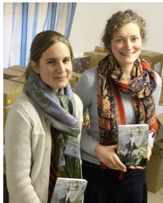
Cedar College of Education