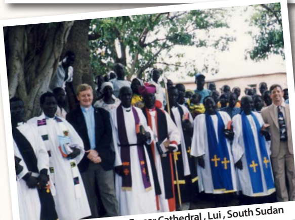
Resurrection Sunday at Fraser Cathedral, Lui, South Sudan

Our highest priority is to love God with all of our heart, soul, mind and strength, and to love our neighbour as ourselves. Christ's Great Commission must be our supreme ambition.