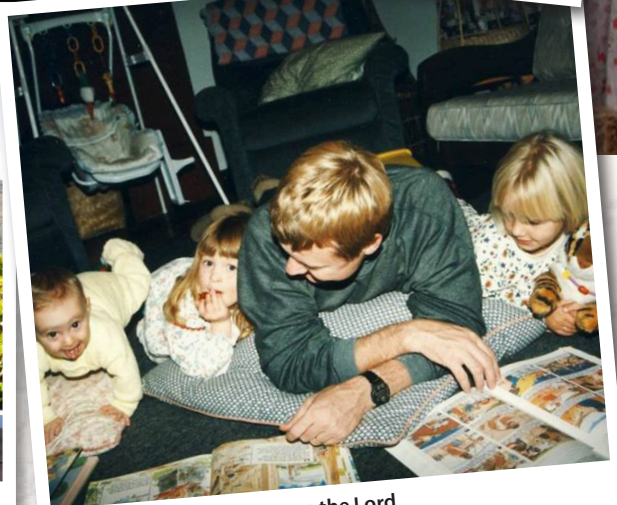
All of Peter's children serve the Lord