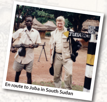
En route to Juba in South Sudan