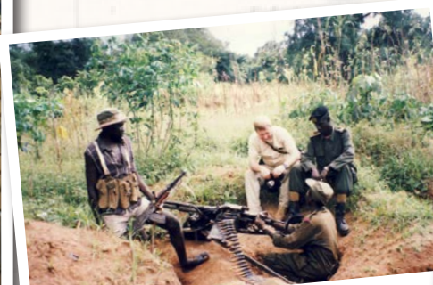
On the battlefield