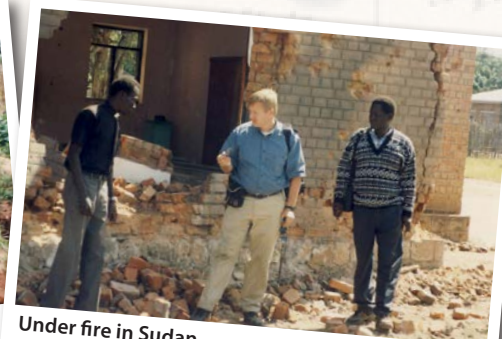
Under fire in Sudan