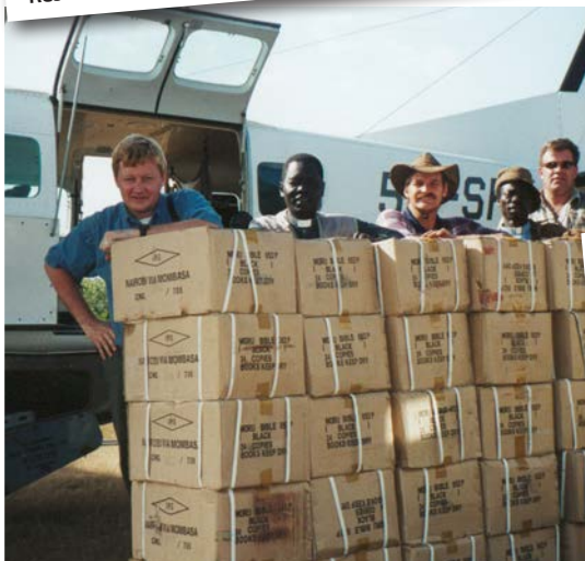
Bibles smuggled into an Islamic State