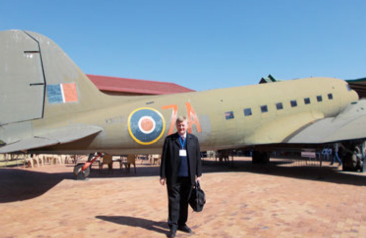
Lecturing at the War Museum on the Crimean War, Russia and Ukraine