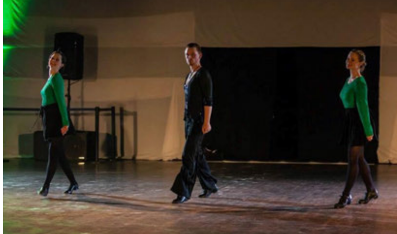
Irish dancing at the Ballroom Showcase Around the World in 80 Minutes (Representing Ireland)